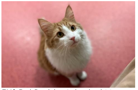
EHS Pet Buddy, Adopted May

As a non-profit, nearly 70% of EHS' funding comes from our community from special events, donations, and fundraising initiatives -- including Kennel Sponsorship. This support comes from people <u>like you</u>: kind-hearted, caring individuals and organizations who want to improve the lives of companion animals.