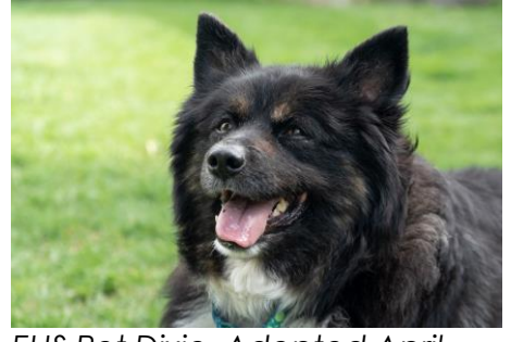
EHS Pet Dixie, Adopted April

By sponsoring a kennel for one year, you are helping us to provide a safe space for the animals who enter our shelter and give them the care and treatment they need to have a chance at finding a new, loving family. Beyond sheltering, you are also helping to further our work in supporting happy, lifelong bonds with their pets by providing education, training and resources for pet guardians.